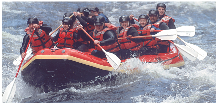
Professional River Runners offers various whitewater rafting trips on the Kennebec River in Maine from April to October.

The first rapid, called Taster, was just the beginning of a heart-stopping several-mile series that intensifies in strength until we are dropped over Magic Falls — a Class IV rapid. We are far from the end of our trip, but have reached